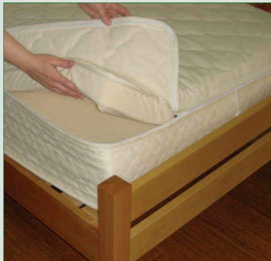
Zippered Sagittarius Mattress, unzipped and Pacific Rim Arts & Crafts Bed with modified footboard